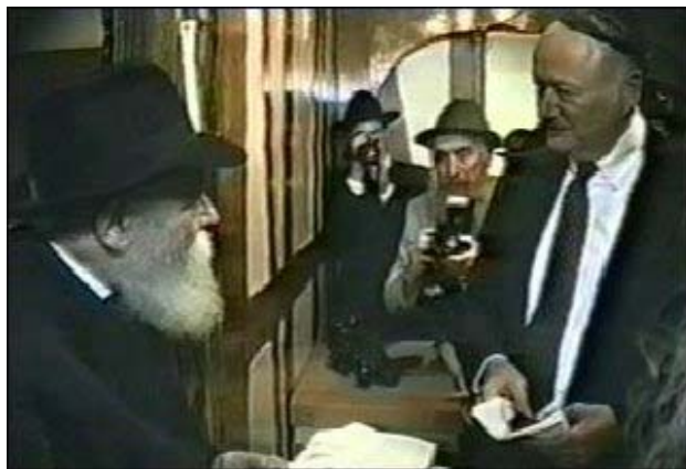
Former Mayor of New York, Ed Koch

...At the same Lubavitcher "Award" ceremony. Inset: Hillary Rodham Clinton (Wife of Bill Clinton) was also in attendance (Again, note picture of the racist "Rebbe" [i.e. "Teacher"] in the background).